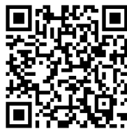
F-160 REV 1 Part A SDS